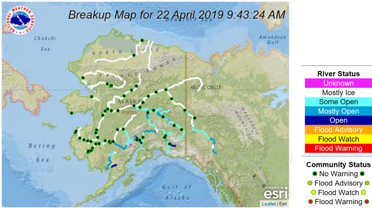
APRFC Breakup Map

For the most current Breakup Map, go to: https://www.weather.gov/aprfc/breakupMap